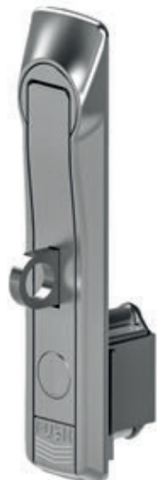
Version with shackle